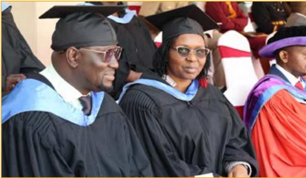
KMTTC Managers follow the graduation proceedings.