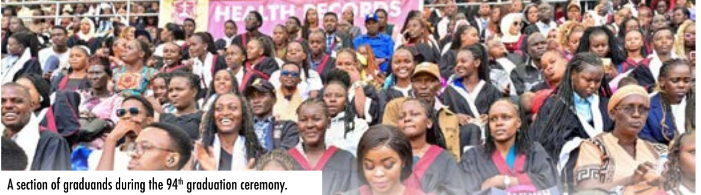
A section of graduands during the 94 th graduation ceremony.

Kenya celebrated a significant milestone in its health sector today as the Deputy President, H.E. Prof. Kindiki Kithure, officiated at the 94 th Kenya Medical Training College (KMTC) Graduation Ceremony held at the Moi International Sports Centre in Kasarani. The event brought together national leaders, development partners, families, and thousands of students to witness the graduation of 22,776 new health professionals who are set to join the frontline of Kenya's healthcare system.