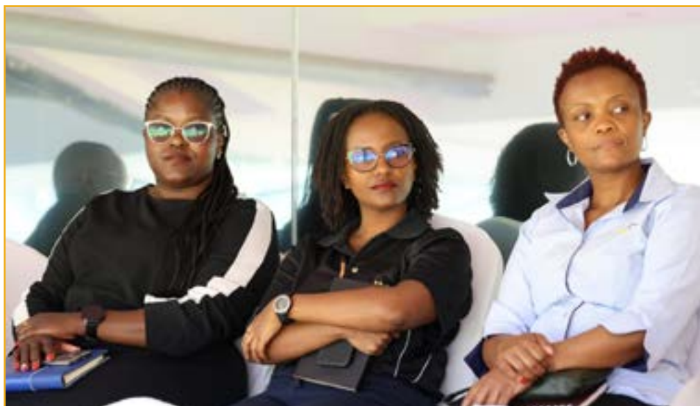
Attendees during the graduation proceedings.