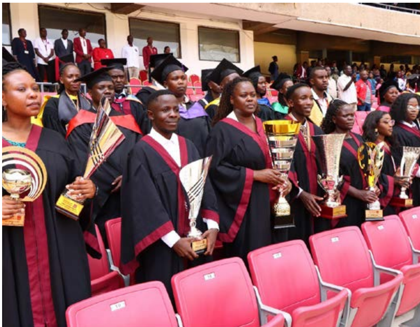
A section of winners of the various College awards.