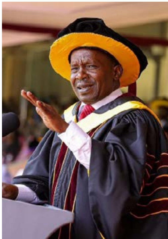
Chief Guest, Deputy President H.E. Prof. Kithure Kindiki, gives the keynote address at the 94 th Graduation Ceremony.

Today, the government has ensured that Kenyans are protected from catastrophic health expenses. This has been made possible by mass registration of Kenyans under the