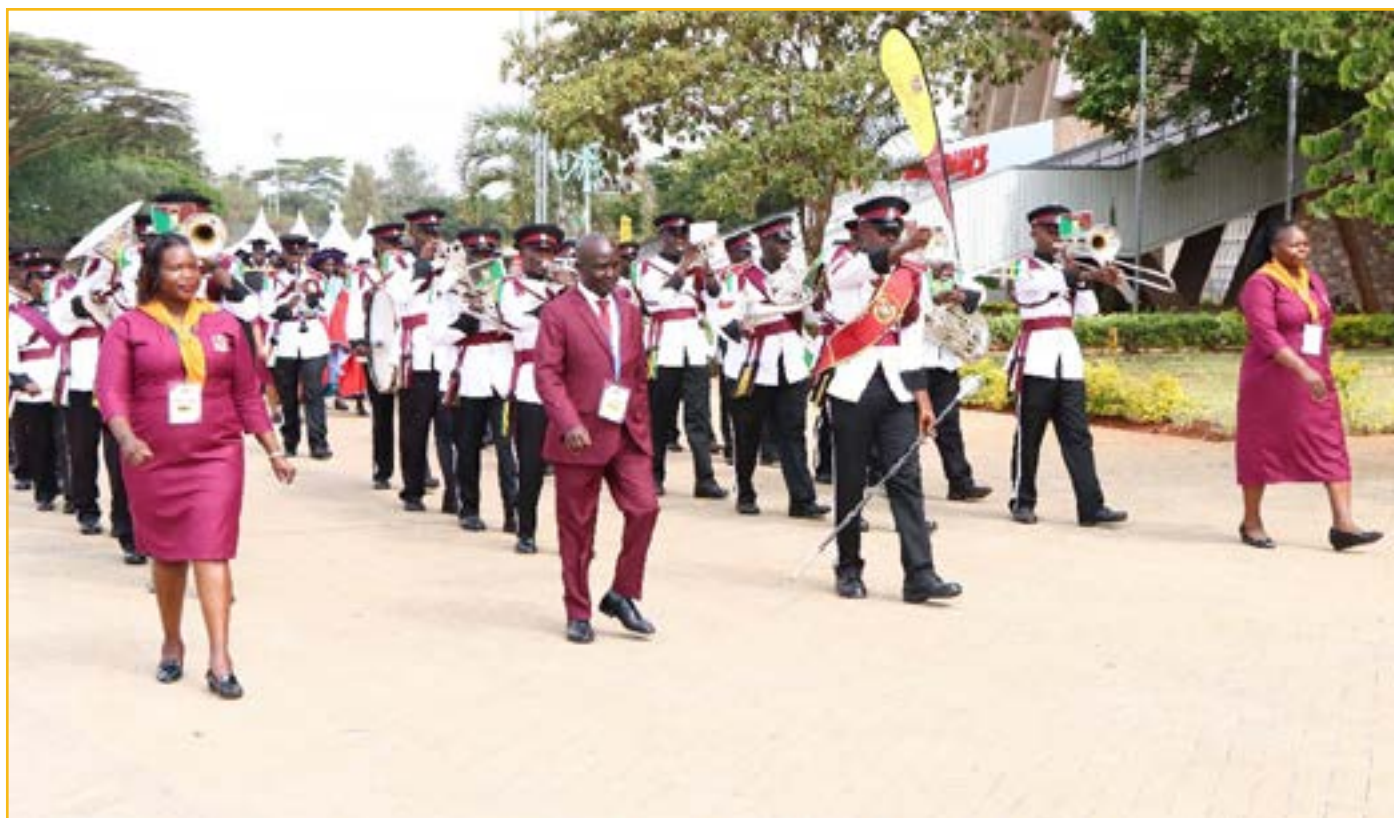
KMTC ushers with the Administration Police Band during the graduation ceremony.