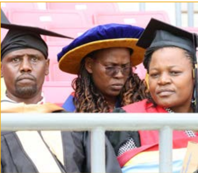
KMTTC staff members during the graduation.