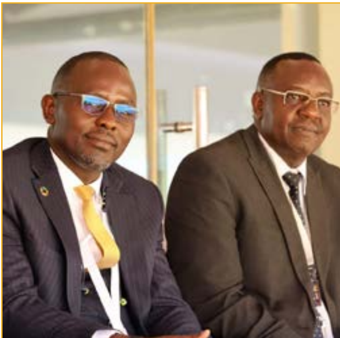
Invited guests during the proceedings.

Excellence and align to the educational reforms including Competency Based Education.