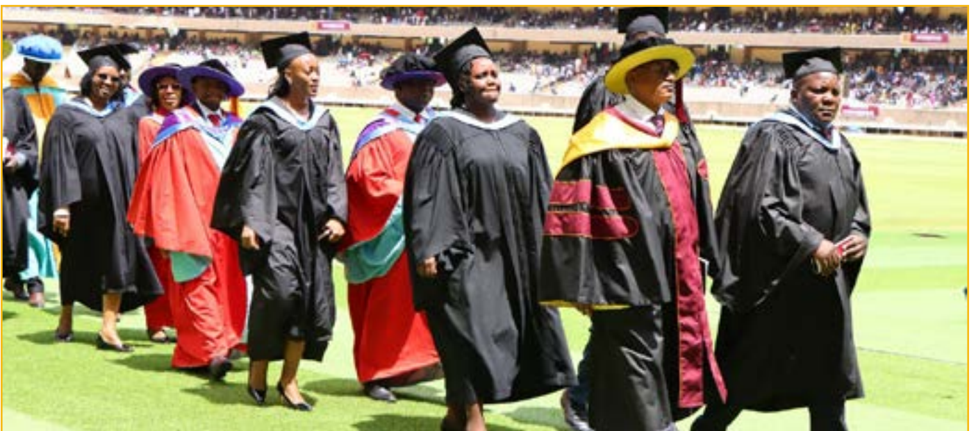
A section of KMTTC Managers and Board Directors during the procession.