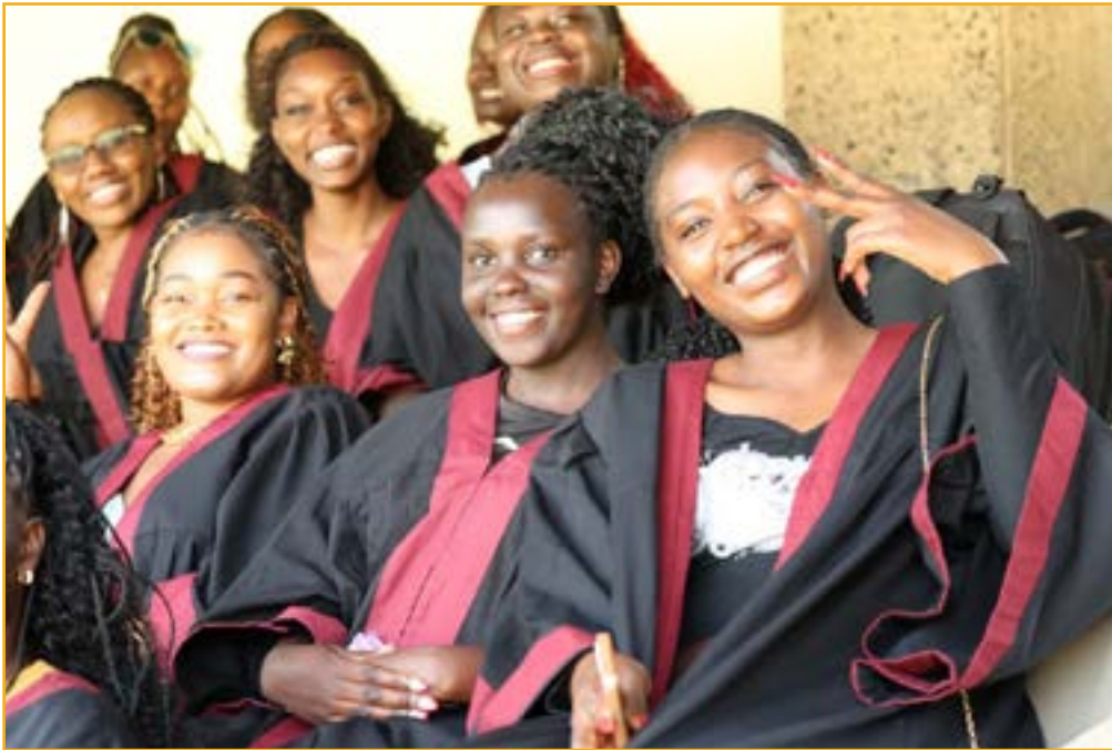
Graduands strike a pose as they follow proceedings.