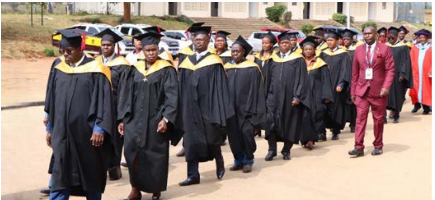
A section of KMTC Principals and Heads of Academic Departments in the graduation procession.