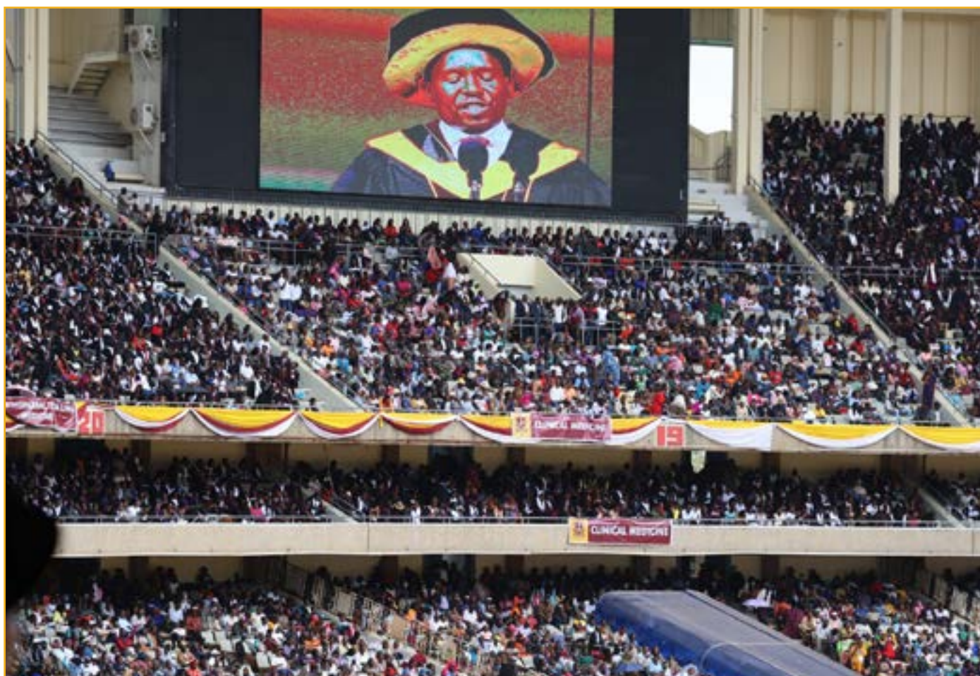
A section of graduands during the ceremony.

God bless you all. God bless KMTC. God bless Kenya.