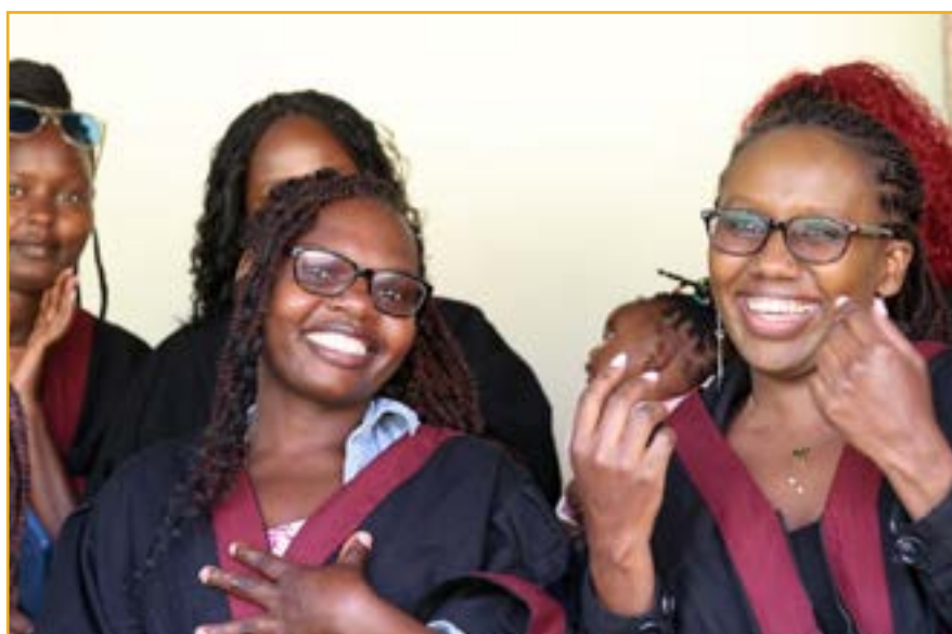
Photo 1 and 2: A section of graduands during the ceremony.