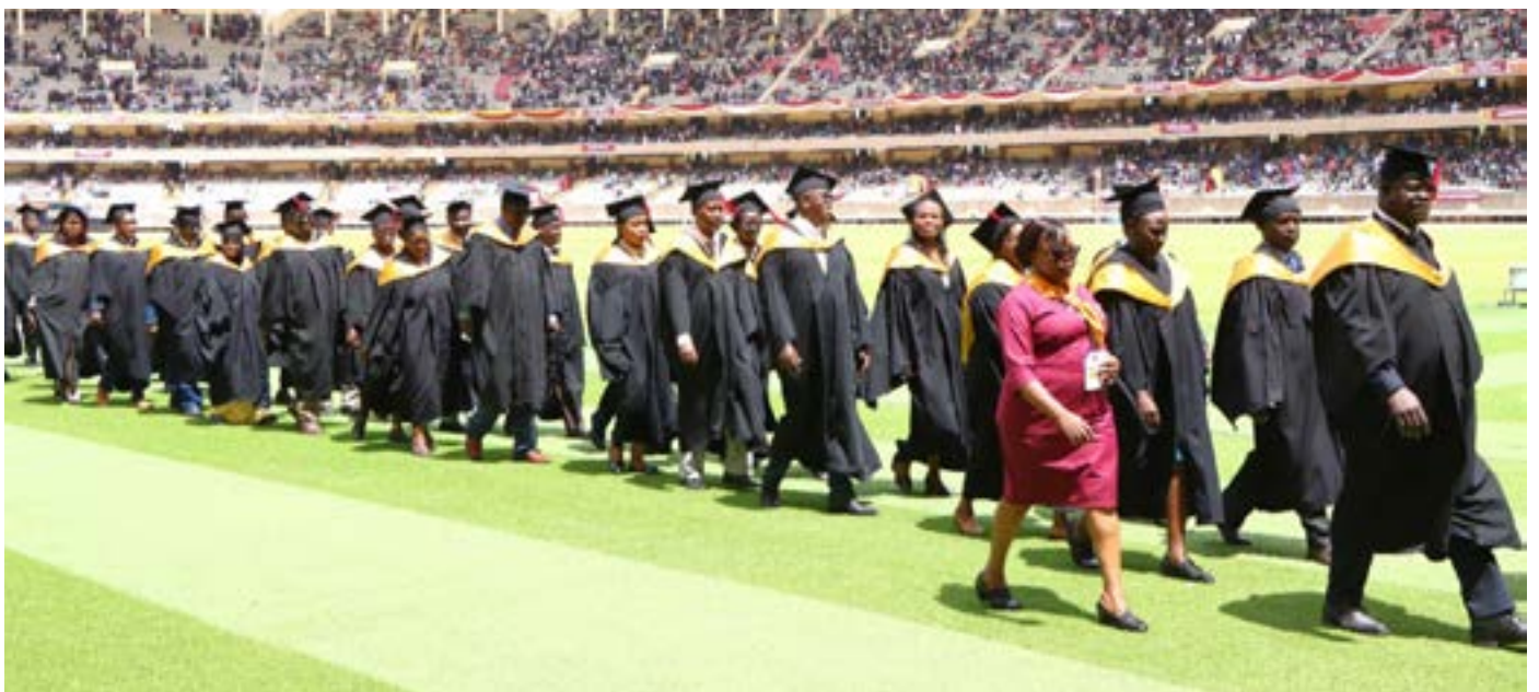
A section of KMTC Principals in the graduation procession.