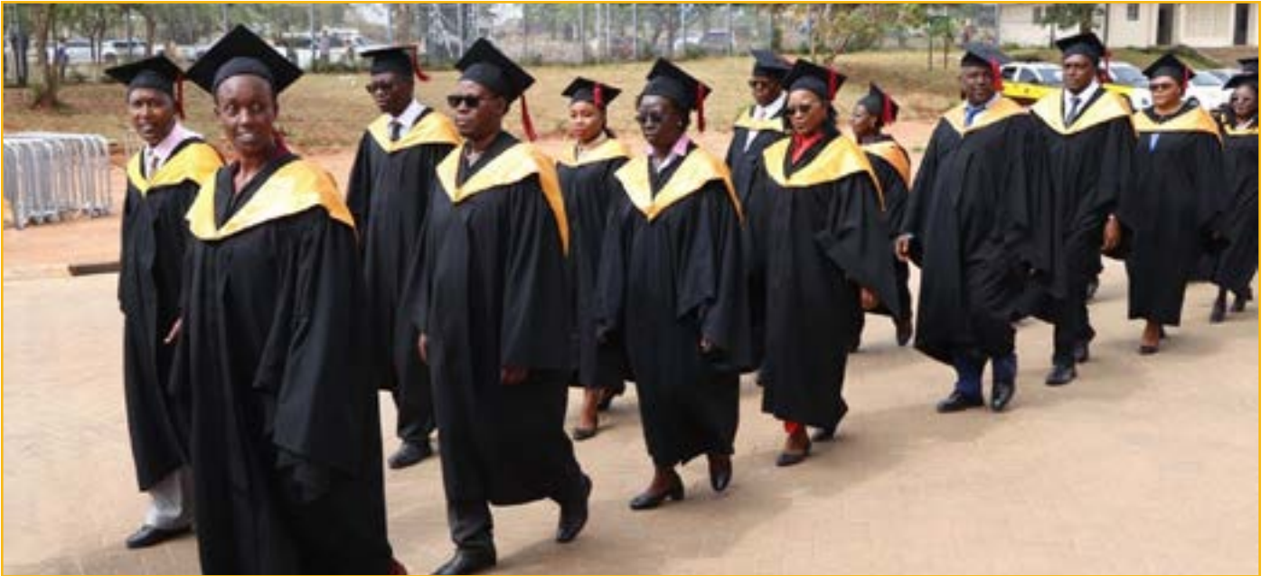
A section of KMTTC Principals in the procession during the Graduation.