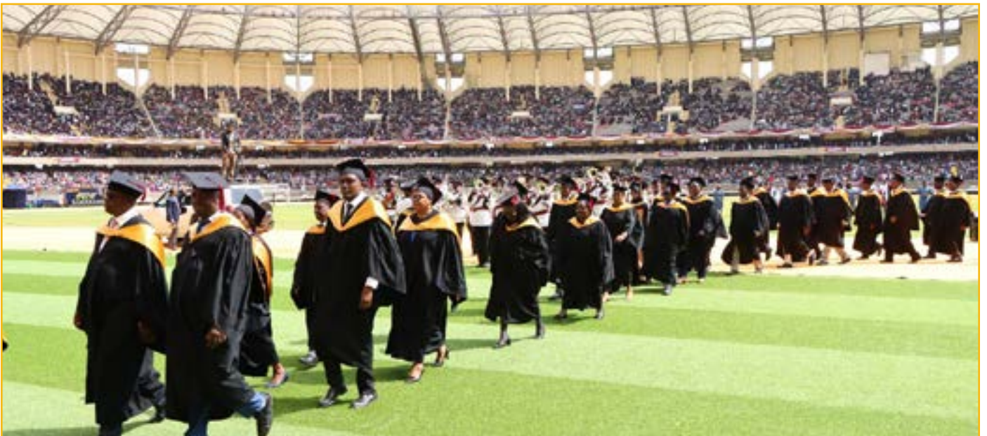
A section of KMTTC Principals during the graduation procession.